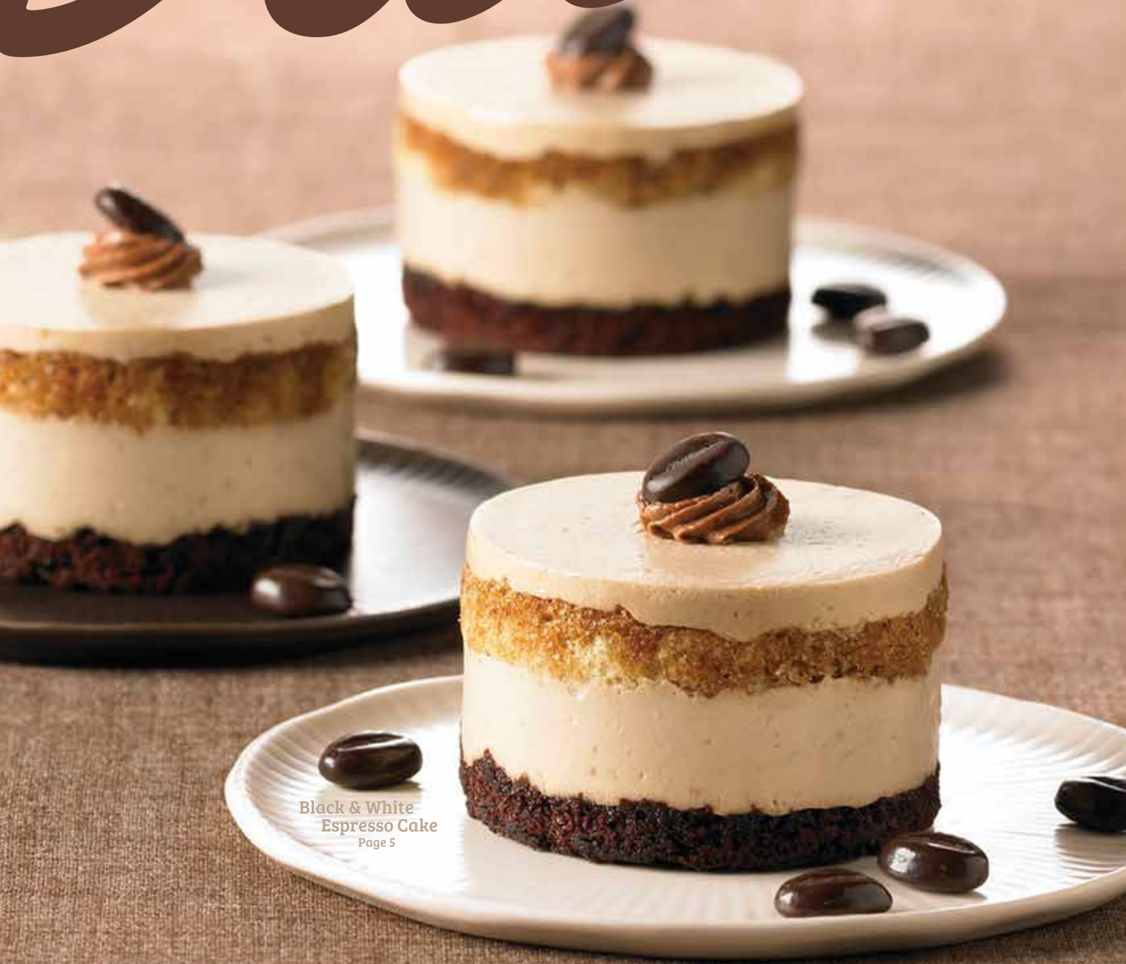
Black & White Espresso Cake Page 5