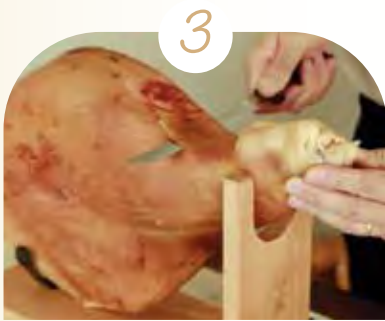
Begin peeling away the pork rind. Be sure the pork fat below the rind is very clean to avoid a bitter taste.