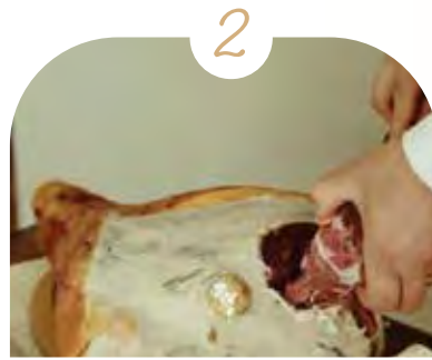
Place the hoof end of the ham facing upward on the holder. Make a deep cut about \frac{3}{4} of an inch down, around the upper portion of the ham.