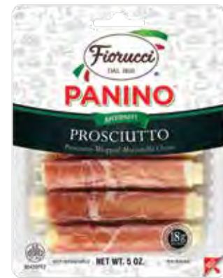
PROSCIUTTO AND MOZZARELLA PANINO #80439