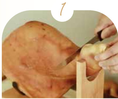
Remove the bone from the ham.