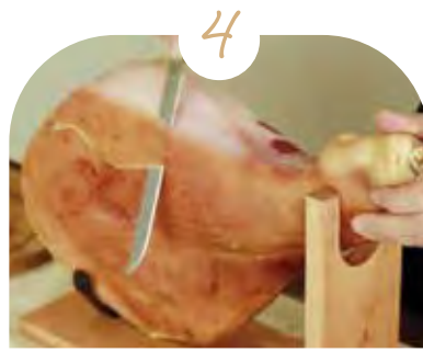
Peel away only the area of the ham rind above the portion you plan to slice. Save the white fat that you peel away so you can use it to cover the exposed ham later.