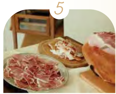
Now slice the Prosciutto lengthwise from the upper portion of the ham downward. Hold your knife firmly, making straight, thin, parallel cuts about 4-6 inches long.