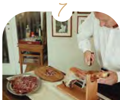
When you are done with one side, turn the leg over and repeat the slicing process.