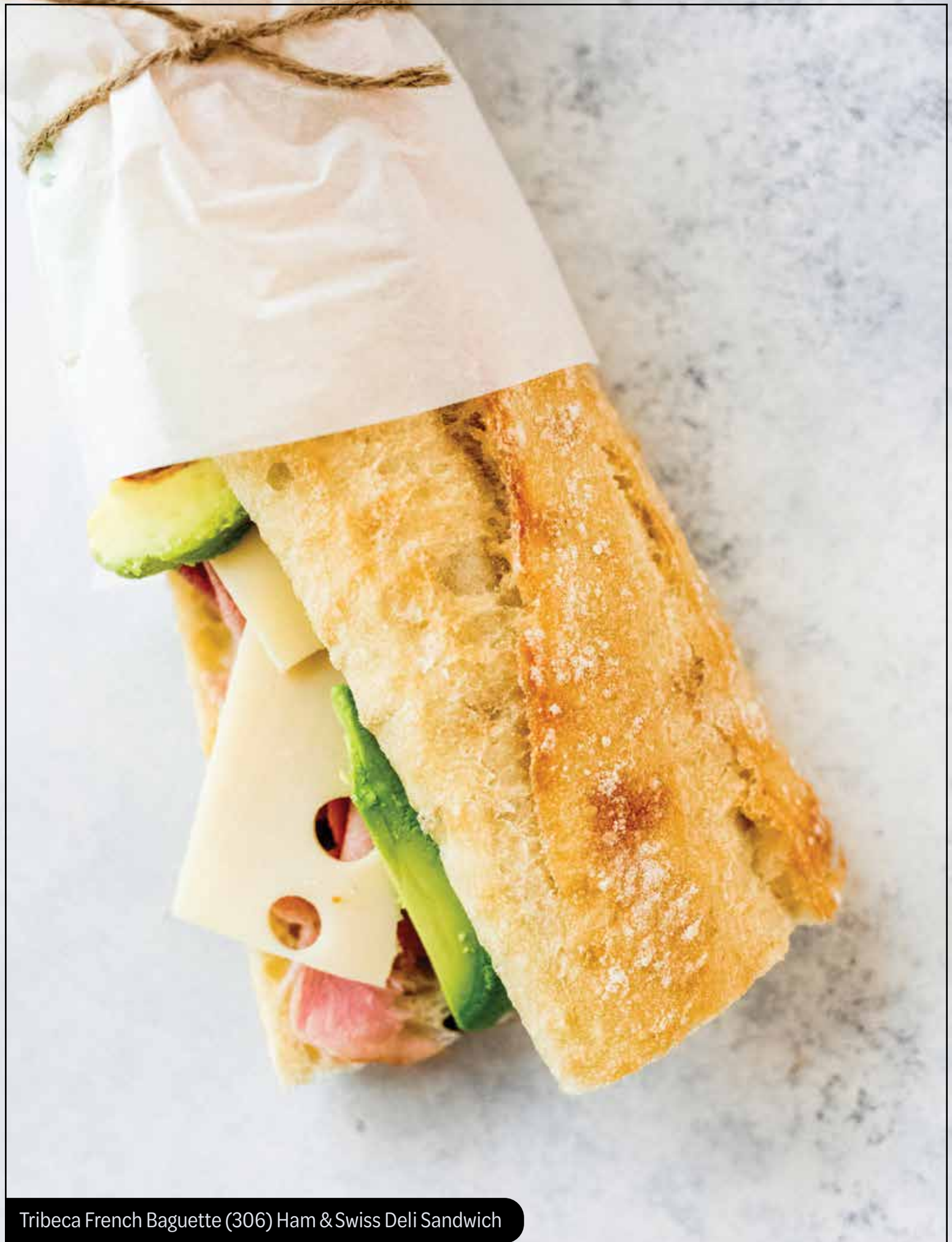
Tribeca French Baguette (306) Ham & Swiss Deli Sandwich