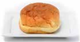
Thaw & Serve / Sliced 4.5" HAWAIIAN DELUXE BUN #4471 • 30/2 ct • King's Hawaiian