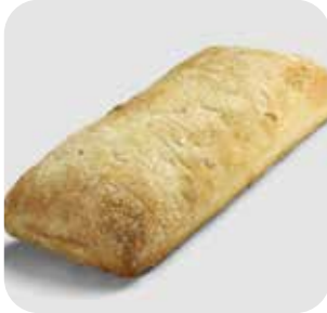
Thaw & Bake / Unsliced 3 X 6" CIABATTA PANINI #286 • 48/3.25 oz • Bakery De France