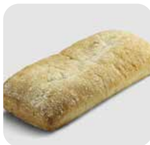
Thaw & Bake / Unsliced 3 X 6" ROSEMARY CIABATTA PANINI #336 • 48/3.25 oz • Bakery De France