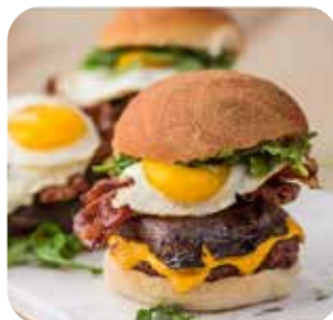
Proof & Bake / Unsliced KAISER ROLL DOUGH #2425 • 144/2.75 oz • Rich's