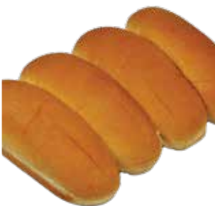
Thaw & Serve / Sliced 5.75" CONEY ISLAND HOT DOG ROLL Piantedosi