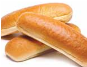
Thaw & Serve / Sliced SUB ROLLS