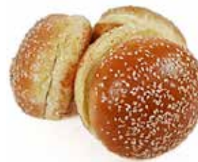
Thaw & Serve / Sliced 4" SESAME SEEDED HAMBURGER #4441 • 8/12 ct • Piantedosi