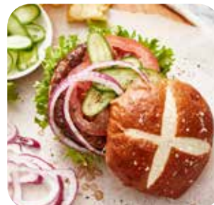
Thaw & Serve / Sliced 4" BAVARIAN PRETZEL ROLL #4480 • 72/2.8 oz • Prop & Peller