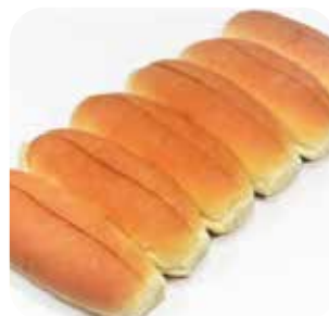
Thaw & Serve / Sliced 6" BRIOCHE LOBSTER ROLL #4499 • 12/6 ct • Piantedosi