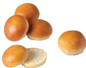
Thaw & Serve / Sliced 2.5" CHALLAH SLIDER #297 • 192 ct • Tribeca