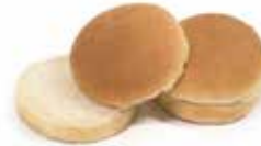
Thaw & Serve / Sliced 4" HAMBURGER #4466 • 8/12 ct • Rotella's