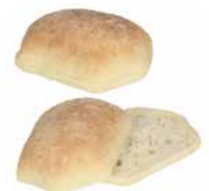
Thaw & Serve / Sliced 4 X 5" TELERA ROLL #4576 • 96/3 oz • LaBrea Slightly sweet interior and a thin golden crust. Perfect for a traditional Mexican Torta or barbecue sandwich.