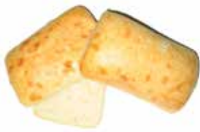
Thaw & Serve / Sliced 4 X 6" CIABATTA ROLL #4556 • 8/8 ct • European Bakers