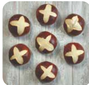
Thaw & Serve / Sliced 4" PRETZEL ROLL #4475 • 72/3.4 oz • J&J (Labroila)