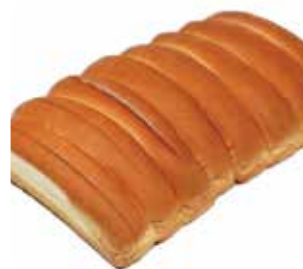
Thaw & Serve / Sliced 5.75" NEW ENGLAND STYLE HOT DOG ROLL #4468 • 6/16 ct • Piantedosi