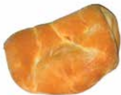
COCO BREAD #283 • 24/6 oz • Tower Isle Good for Jamaican patties.