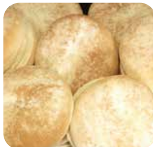
Thaw & Serve / Sliced / Flour Dusted 4.5" KAISER ROLL #4449 • 4/12 ct • Piantedosi