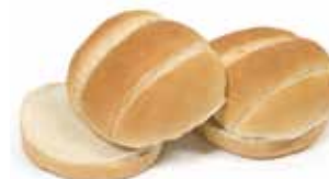
Thaw & Serve / Sliced 4" SPLIT TOP GOURMET HAMBURGER #4442 • 6/8 ct • Rotella's Tender crumb and rich flavor.