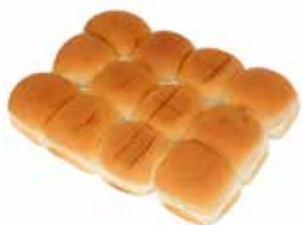
Thaw & Serve / Sliced 2.5" SQUARE SLIDER #4458 • 8/24 ct • European Bakers