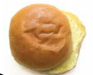
Thaw & Serve / Sliced / Vegan 4" POTATO ROLL #4461 • 8/12 ct • Piantedosi