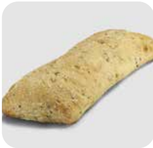
Thaw & Bake / Unsliced 3 X 6" MULTI-GRAIN CIABATTA PANINI #287 • 48/3.25 oz • Bakery De France Thin crust and a hearty whole grain center.