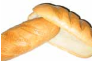
Thaw & Serve / Sliced 7.5" SUB ROLL