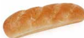
Thaw & Serve / Sliced 6.5" SUB ROLL