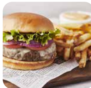
Thaw & Serve / Sliced / Vegan 4" HAMBURGER #348 • 80/2.65 oz • Golden Harvest