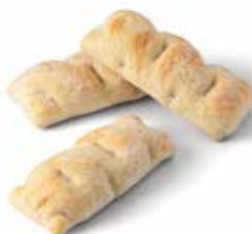
Parbaked / Unsliced 7.5 X 3.5" OLIVE OIL FOCACCIA PANINO #353 • 60/4.9 oz • Tribeca