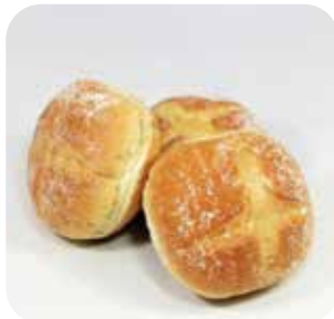
Thaw & Serve / Sliced 4" KAISER ROLL #4439 • 8/12 ct • Piantedosi