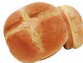
Thaw & Serve / Sliced / Vegan 4.5" POTATO ROLL #4551 • 8/12 ct • Piantedosi