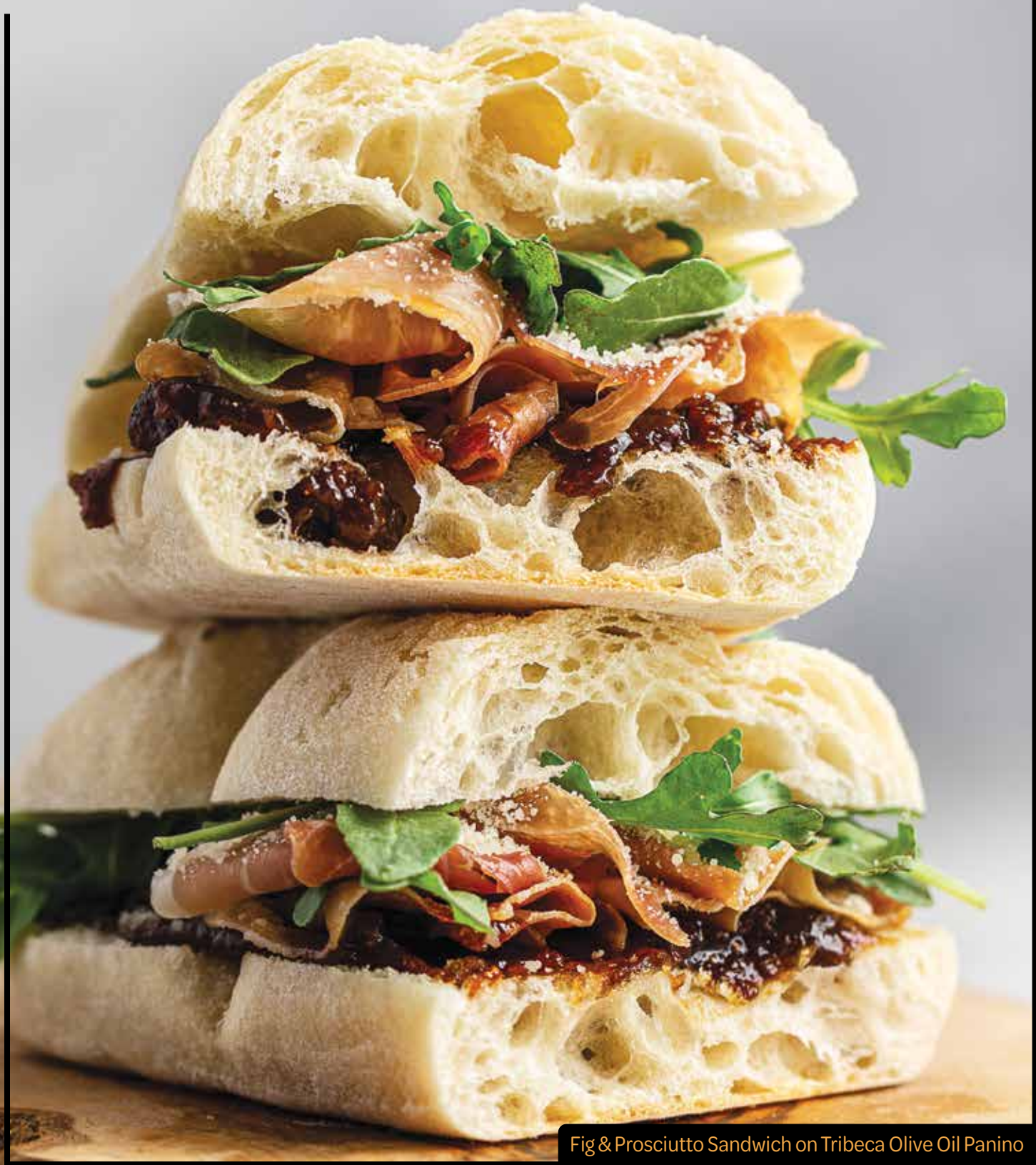
Fig & Prosciutto Sandwich on Tribeca Olive Oil Panino