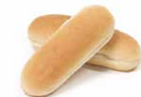
Thaw & Serve / Sliced 6" HOT DOG ROLL #240 • 6/12 ct • Rotella's

Side Slice Soft, tight crumb and mild yeast flavor.