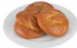
Thaw & Serve / Sliced 4.75" GIANT PRETZEL ROLL #4445 • 80/4 oz • J&J (Bavarian Bakery)