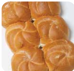
Thaw & Serve / Sliced 4-5" KAISER ROLL #4494 • 4/12 ct • Felix Roma