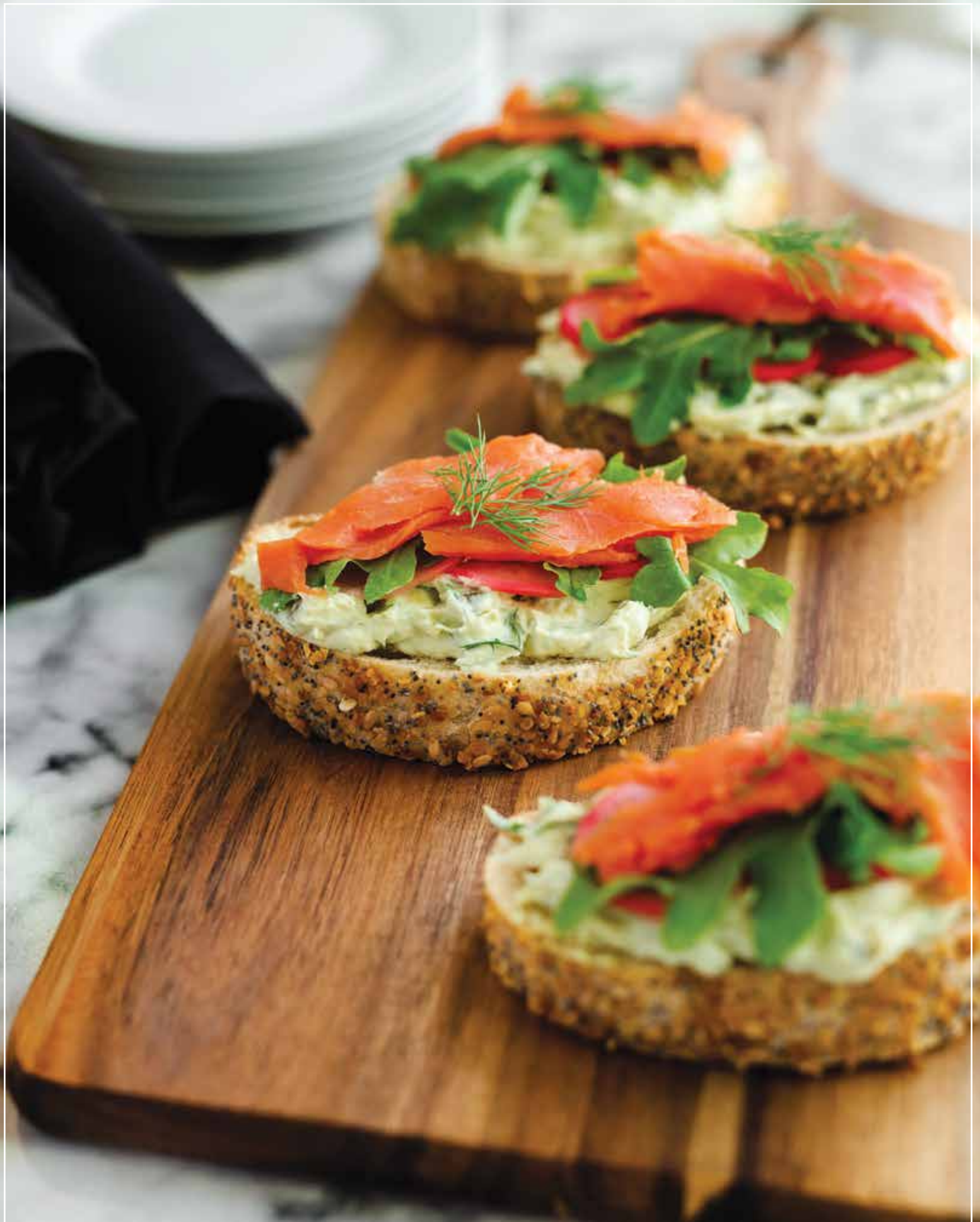
Tribeca Everything Ciabatta Loaf (355) - Salmon Toast