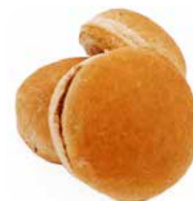
Thaw & Serve / Sliced 3.75" WHEAT HAMBURGER #4436 • 120/2 oz • Piantedosi