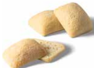
Parbaked / Unsliced 4 X 4.5" STIRATO SQUARE #4549 • 60/2.75 oz • Tribeca A blend of durum & wheat flours plus extra virgin olive oil give this a thinner crust and a light, tender texture. Great for sandwiches and/or to make paninis.