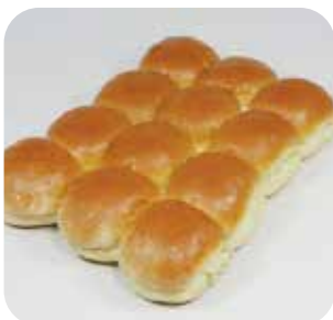
Thaw & Serve / Sliced 2.3" BRIOCHE SLIDER #4459 • 8/24 ct • Piantedosi