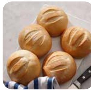
Parbaked 4" SOFT FRENCH ROUND #4537 • 88/2.9 oz • Vie De France