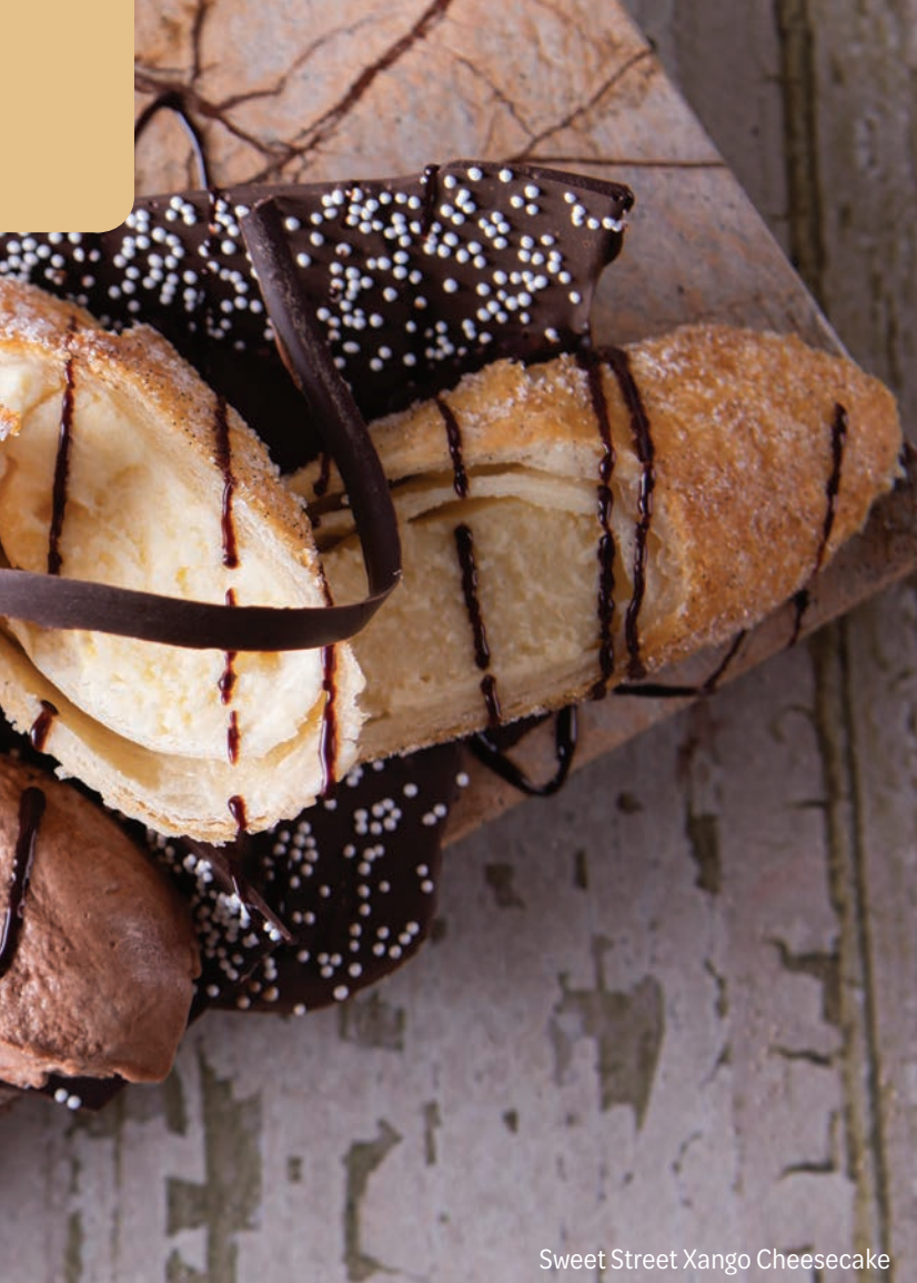
Sweet Street Xango Cheesecake