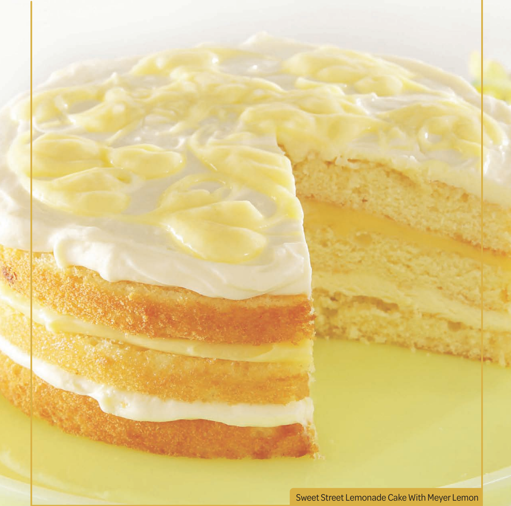
Sweet Street Lemonade Cake With Meyer Lemon