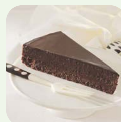
GLUTEN FREE | Sliced 10" FLOURLESS CHOCOLATE TORTE #1666 • 2/16 slice • Sweet Street Takeout Container #66472

Can be refrozen Simple, elegant & timeless. Contains: egg, milk, soy