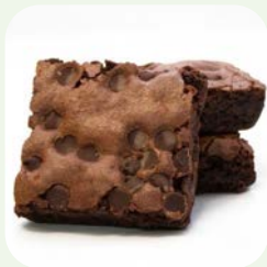
GLUTEN FREE | Individually Wrapped CHOCOLATE CHIP BROWNIE #399 • 48/3.5 oz • David's

Fully baked, gluten-free, nut-free, dairy-free, trans fat-free individually wrapped and labeled uniced brownie. Contains: egg, soy