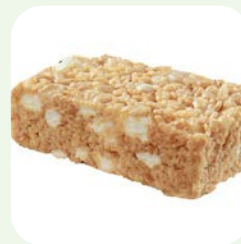
GLUTEN FREE | Individually Wrapped RICE MARSHMALLOW TREAT #22499 • 40/2.1 oz • Sweet Street

A gluten-free, nut-free, dairy-free, trans fat-free pre-portioned IQF ready to bake cookie dough. Contains: egg, soy