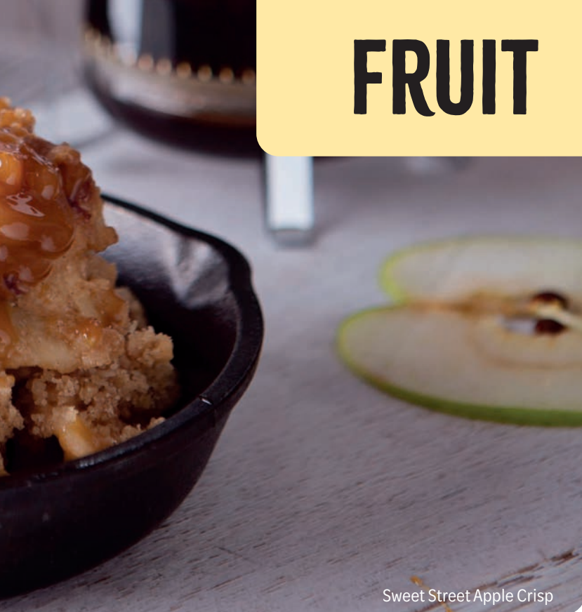
Sweet Street Apple Crisp