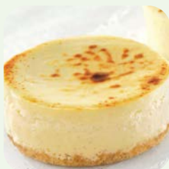
GLUTEN FREE | Individual VANILLA BEAN CHEESECAKE #522 • 32 ct • Sweet Street

Packed 8 trays of 4 Vanilla bean creme brûlée custard with macerated Madagascar vanilla pods. Crispy baby oat laced bottom with more vanilla. Contains: egg, milk, soy