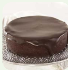
GLUTEN FREE | Non GMO | Individual FLOURLESS CHOCOLATE CAKE #806 • 32/3.23 oz • Sweet Street Takeout Container #66440

Packed 8 trays of 4 Made with a blend of four chocolates and finished with a ganache topping. Contains: egg, milk, soy