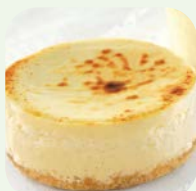
GLUTEN FREE | Individual VANILLA BEAN CHEESECAKE #522 • 32 ct • Sweet Street

Packed 8 trays of 4 Vanilla bean creme brûlée custard with macerated Madagascar vanilla pods. Crispy baby oat laced bottom with more vanilla. Contains: egg, milk, soy