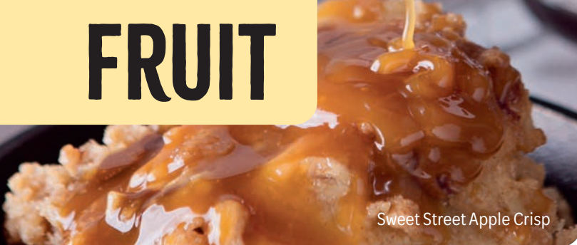
Sweet Street Apple Crisp