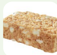
GLUTEN FREE | Individually Wrapped RICE MARSHMALLOW TREAT #22499 • 40/2.1 oz • Sweet Street

A gluten-free, nut-free, dairy-free, trans fat-free pre-portioned IQF ready to bake cookie dough. Contains: egg, soy