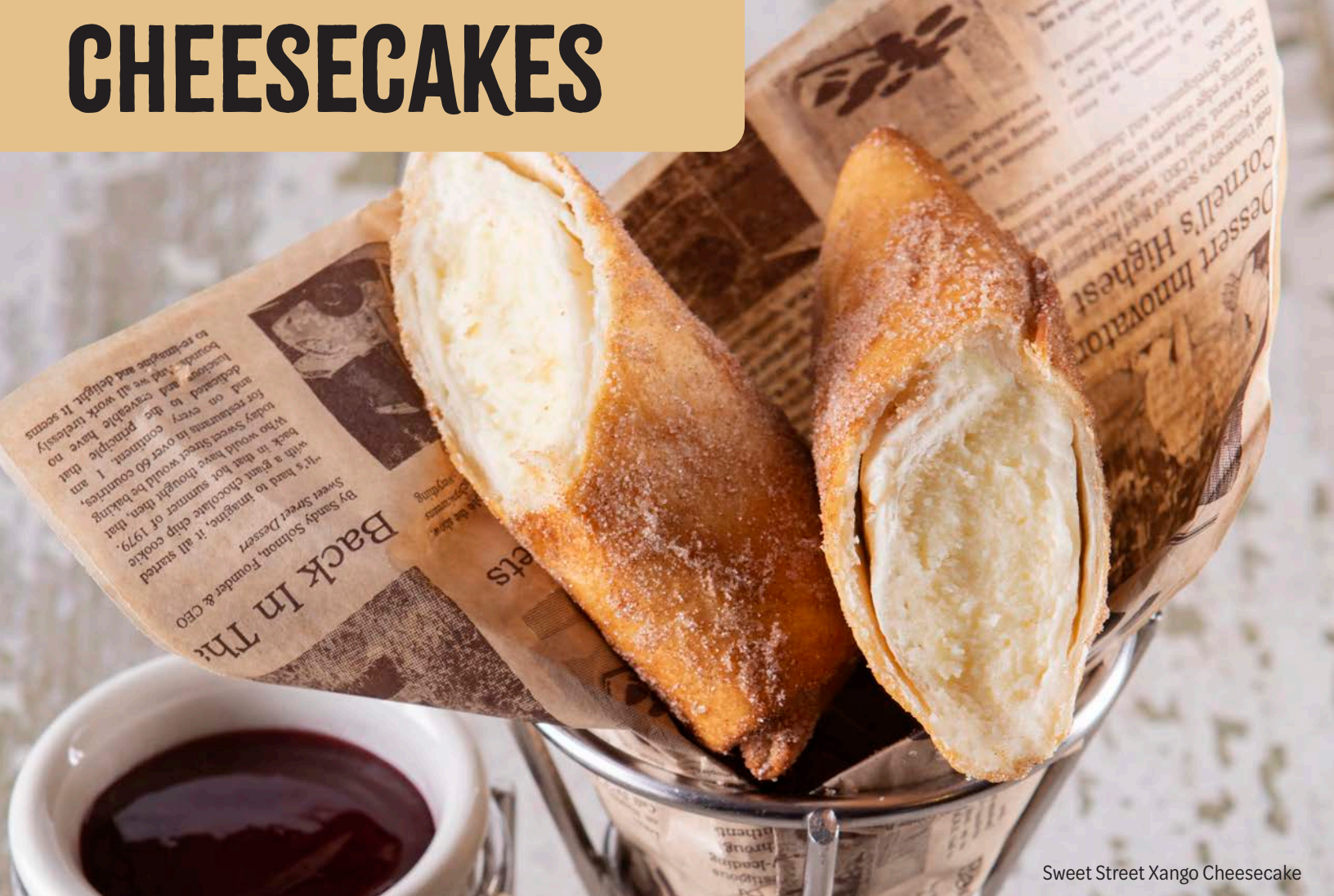
Sweet Street Xango Cheesecake