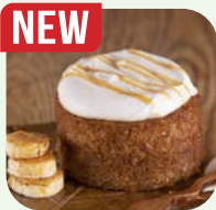
NEW GLUTEN FREE | Individual BANANA WALNUT CAKE #529 • 32 ct • Sweet Street Takeout Container #66440

Packed 8 trays of 4 Blend of freshly pureed bananas, gluten-free flour, coconut milk and savory walnuts with a light flourish of whipped coconut cream. Contains: soy, tree nuts