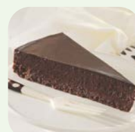
GLUTEN FREE | Sliced 10" FLOURLESS CHOCOLATE TORTE #1666 • 2/16 slice • Sweet Street Takeout Container #66472

Can be refrozen Simple, elegant & timeless. Contains: egg, milk, soy