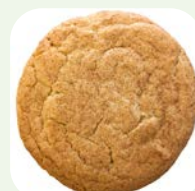
GLUTEN FREE | Ready to Bake SNICKERDOODLE COOKIE DOUGH #22545 • 120/1.5 oz • David's

A gluten-free, nut-free, dairy-free, trans fat-free pre-portioned IQF ready to bake cookie dough. Contains: egg, soy