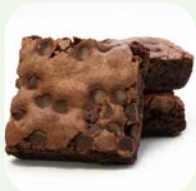
GLUTEN FREE | Individually Wrapped CHOCOLATE CHIP BROWNIE #399 • 48/3.5 oz • David's

Packed 8 trays of 4 Blend of freshly pureed bananas, gluten-free flour, coconut milk and savory walnuts with a light flourish of whipped coconut cream. Contains: soy, tree nuts