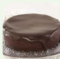
GLUTEN FREE | Non GMO | Individual FLOURLESS CHOCOLATE CAKE #806 • 32/3.23 oz • Sweet Street Takeout Container #66440

Packed 8 trays of 4 Made with a blend of four chocolates and finished with a ganache topping. Contains: egg, milk, soy