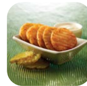
Battered Pickle Chips #82228 • 6/2 lb • Fred's

BAKE OR FRY Fresh cut onion wedges coated with a special batter. Contains: Milk & Wheat