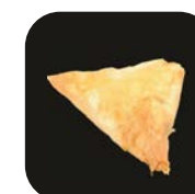
0.60 oz Spanakopita #82170 • 2/80 ct • Les Chateaux BAKE Filled with spinach, Feta cheese, cream cheese, fresh whole eggs, sautéed onions, seasonings & wrapped in hand-stretched fillo dough. Contains: Eggs, Milk & Wheat

BAKE A delicious blend of spinach, cheeses & savory spices folded into fillo dough. Contains: Eggs, Milk & Wheat