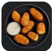
Jalapeño Poppers w/Cream Cheese #82321 • 4/4 lb • Golden Crisp

FRY Creamy cheddar cheese on mild jalapeño pepper halves in light, crispy potato flake breading. Contains: Milk & Wheat