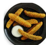
Breaded Pickle Spears #81339 • 4/4 lb (68 ct) • McCain

FRY Made from dill pickles that are sliced in-house to ensure extra crispiness & added freshness. Contains: Milk, Soy & Wheat