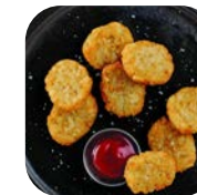
Mini Potato Pancakes #97255 • 6/3 lb (428 ct) • McCain

FRY 40 to 60 ct Crispy with a firm outer layer & juicy texture inside. Coated in a seasoned batter, flour breaded & par-fried. Contains: Wheat