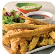
Battered Eggplant Fries #82240 • 2/5 lb • Dominex

FRY Sweet Grade A creamed-style sweet corn coated with a crispy batter. Contains: Milk & Wheat