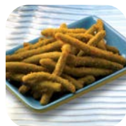
Toasted Onion Battered Green Beans #82192 • 6/2 lb • Fred's

Dolmades are traditionally cooked using delicate grape leaves filled with a savory rice stuffing.