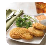
Breaded Fried Green Tomatoes #39322 • 6/2 lb • Tampa Maid

FRY 9 to 15 slices per pound Thick slices of fresh, tart green tomatoes coated in seasoned flour with a hint of salt & pepper. Contains: Wheat