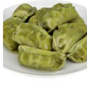
Thai-Style Vegetable Potstickers #12679 • 120/0.70 oz • Ajinomoto

BAKE | FRY Fresh bok choy, bamboo shoots, carrots, celery, cabbage, water chestnuts & authentic Asian seasonings rolled in a crispy egg roll wrapper. Contains: Egg, Sesame Seeds, Soy & Wheat