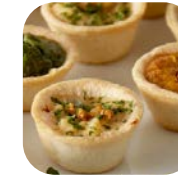
1" Assorted Mini Quiche #82132 • 100 ct • Les Chateaux

BAKE | FRY Fun-sized shredded potato mini pancakes with a light seasoning.