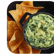
Spinach & Artichoke Dip with Cheese #82200 • 36/6 oz • Anchor

BAKE (35) Quiche Lorraine, (20) Sun-Dried Tomato & Wild Mushroom Quiche, (25) Cheddar & Spinach Quiche, (20) Seafood Quiche.