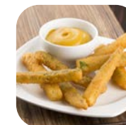
Battered Zucchini Sticks #82342 • 6/2.5 lb • Anchor

FRY Zucchini sticks coated with Italian cheeses & lightly seasoned bread crumbs. Contains: Milk & Wheat