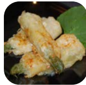
Fillo Wrapped Asiago Asparagus #81432 • 100/0.33 oz • Les Chateaux

BAKE Tender asparagus coated with Asiago cheese tenderly wrapped in fillo dough. Fillo is finished with butter & topped with Asiago cheese & paprika. Contains: Milk, Soy & Wheat