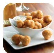
Battered Mushrooms #82249 • 6/2 lb • Fred's

FRY Mild jalapeño pepper halves stuffed with rich cream cheese coated in a light, crispy potato flake breading. Contains: Milk & Wheat