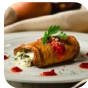
5.5 oz Stuffed Eggplant Rollatini - NO Sauce #34202 • 1/10 lb (28-32 ct) • Gallucci's

BAKE | FRY Made with eggplant and traditional Italian breading. Contains: Wheat