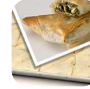
48x3 Spanakopita #82168 • 144/1 oz • Kontos

BAKE Spinach, artichoke hearts, garlic cream cheese, sour cream & bacon blended with mozzarella cheese & a creamy Parmesan cheese sauce. Contains: Milk & Wheat