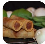
Vegetable Spring Rolls #82183 • 100/0.60 oz • Les Chateaux

BAKE | MICROWAVE Hand rolled eggplant cutlets rolled with mozzarella, spinach & ricotta. Contains: Egg, Milk, Soy & Wheat