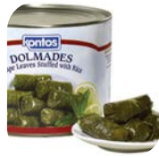
Dolmadakia Stuffed Grape Leaves #16588 • 6/2 kilo can • Kontos

PAN FRY | DEEP FRY | STEAM Bold, balanced flavor of ginger, garlic, & umami. Vegetable blend in green wrapper includes cabbage, onion, carrots, tofu, green onion, potato & vermicelli. Contains: Sesame, Soy & Wheat