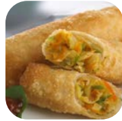
Vegetable Egg Rolls #82181 • 100/0.70 oz • Les Chateaux

FRY A blend of cabbage, carrots, onions, red peppers, mushrooms, ginger, sesame seeds, & spices are added, & then wrapped in a thin dough. Contains: Egg, Sesame, Soy & Wheat