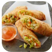
Vegetable Egg Rolls #34266 • 72/3.1 oz (6/12 ct) • Minh

FRY Blend of vegetables & spices that are rolled & wrapped into thin dough wrappers. Contains: Milk, Soy & Wheat