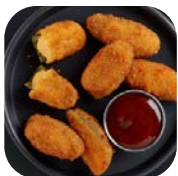
Jalapeño Poppers w/Cheddar #82320 • 4/4 lb • Anchor

FRY Petite, fresh & juicy beans which are coated in a savory batter that creates a mild, crunchy & slightly tangy outer coating. Contains: Milk, Soy & Wheat