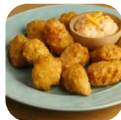
Battered Sweet Corn Nuggets #81340 • 6/2 lb • Golden Crisp

FRY Covered in a light, black pepper flecked batter. Contains: Milk & Wheat