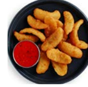
Battered Onion Petals #81341 • 9/2.5 lb • Golden Crisp

BAKE Mini tarts filled with fresh Portobello, shiitake & oyster mushrooms, red peppers, shredded Swiss cheese, herbs & spice. Contains: Eggs, Milk & Wheat