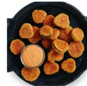
Breaded Pickle Slices #82328 • 6/2.5 lb • Golden Crisp

FRY Lightly coated with a dill flavored breading. Contains: Milk & Wheat