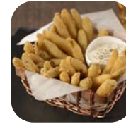
Dipt'n Dusted Pickle Fries #39347 • 5/2 lb • Tampa Maid

FRY 3/16" crinkle cut dill pickles coated in a light cornmeal breading with a hint of spice. Contains: Milk & Wheat