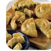
8 oz Cheese & Spinach Fillo Swirlz #2176 • 6/5 ct • Kontos

MICROWAVE Spinach, artichoke hearts, garlic cream cheese, sour cream & bacon blended with mozzarella cheese & a creamy Parmesan cheese sauce. Contains: Milk & Soy