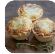
1" Mini Wild Mushroom Tarts #81327 • 100 ct • Les Chateaux

FRY Fresh sliced white button mushrooms coated in a ghost pepper seasoned breading & orange panko crumbs. Contains: Wheat