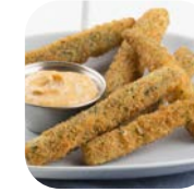
Breaded Zucchini Sticks #82347 • 4/3.5 lb • Anchor

FRY 9 to 15 slices per pound Thick slices of fresh, tart green tomatoes coated in seasoned flour with a hint of salt & pepper. Contains: Wheat