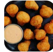
Breaded Mushrooms #82237 • 6/2.5 lb • Anchor

FRY Whole mushrooms dipped in golden batter & par-fried. Contains: Wheat