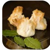
Raspberry & Brie Wrapped in Fillo #81279 • 48 ct • Les Chateaux

BAKE Tender asparagus coated with Asiago cheese tenderly wrapped in fillo dough. Fillo is finished with butter & topped with Asiago cheese & paprika. Contains: Milk, Soy & Wheat