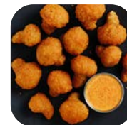
Battered Mushrooms #82247 • 6/2.5 lb • Anchor

FRY Whole button mushrooms in a crispy batter coating. Contains: Eggs, Milk, Soy & Wheat